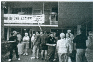
Chow line. Great lunches prepared by members and friends of the host chapter.