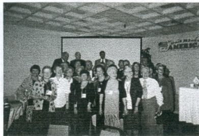
Our Dutch friends from Holland. Great to have them in attendance. They are members of the Society of Dutch Airborne Friends, and will be hosting the veterans and families for the 60th Anniversary celebration in Holland, September 2004.