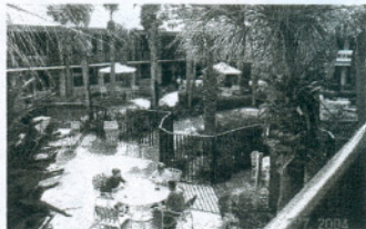
The atrium area for relaxing. We made a few phone calls on Saturday to the Co. I people who are usually there, but were not this year.